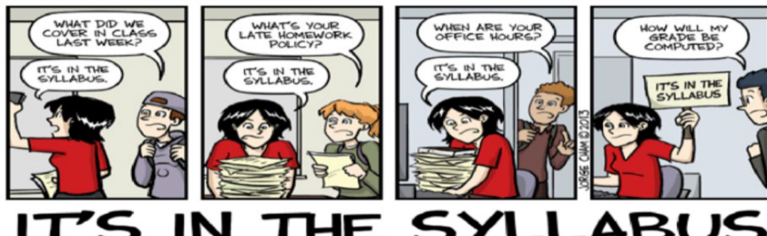
Filed Higher and Deeper by Jorge Cham www.jcham.com

A warm-tone syllabus establishes a rapport between you and your students. It allows communication for the course expectations and is personalized to the instructor. Click on image below to access the full article.