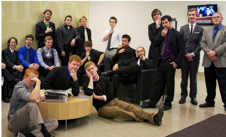
The men of the Iota Sigma Chapter of Lambda Chi Alpha Fraternity