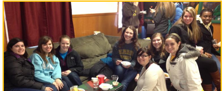
Delta Delta Delta members at the Phi Kappa Psi Chili Cook-Off for #QuelisCause

"Quelis Cause" has sparked the fraternity and sorority community into action raising more than $3,000 in the month of February alone. Different fraternities and sororities hosted events such as the Chi Omega & Sigma Pi Bake Sale, the Lambda Chi Alpha "Let's Smash Cancer" event, the Phi Kappa Psi Chili Cook-Off, the Phi Sigma Kappa Dance Party, the Phi Delta Theta "Harlem Shake" video, and the annual Delta Delta Delta "Hush Crush" event including volunteer assistance from the men of Sigma Chi. Additional events are planned for later this semester by the men of Sigma Phi Epsilon and other chapters within the community.