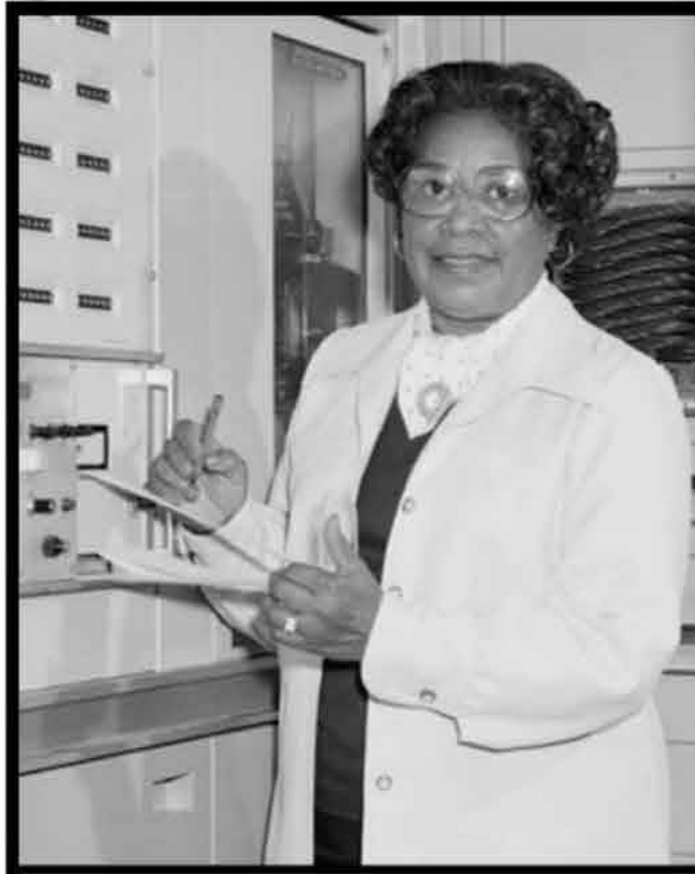
Mary W. Jackson- NASA

By 1945, of the 20,000 US codebreakers during WWII, over half were women. These women decoded intercepted messages which helped to shorten the war and save lives.