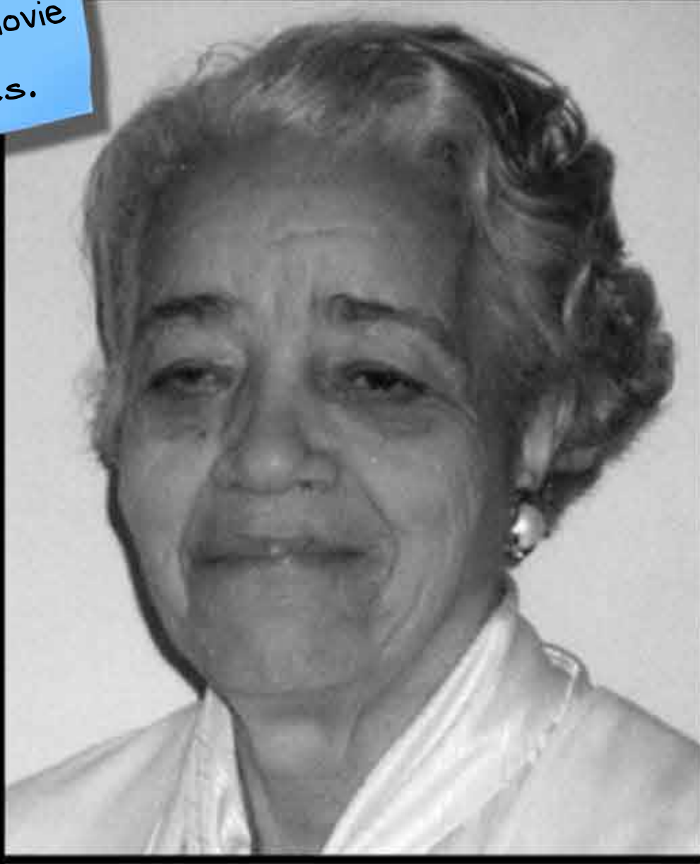
Dorothy J. Vaughan-NASA