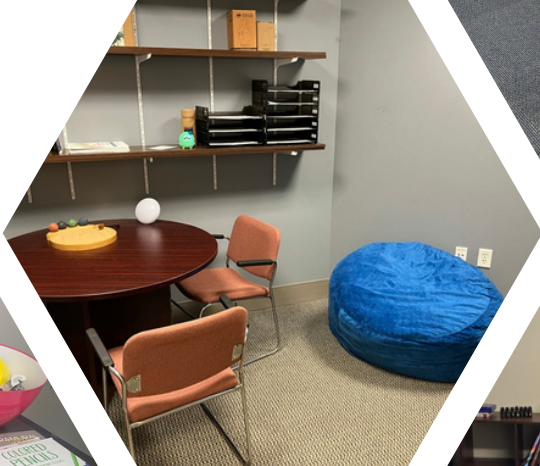
fitness center meditation room