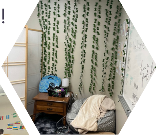
second floor wesemann